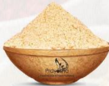
Dry Ginger Powder