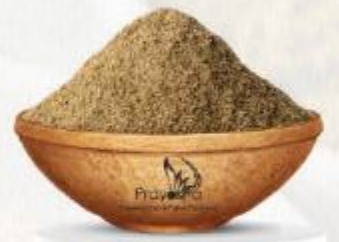
Black Pepper Powder