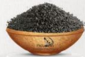
Black Cumin Seeds